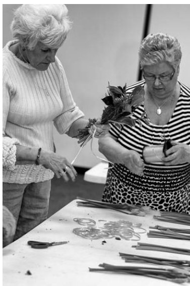
Mother's Day Flower Preparation